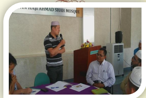
Representative from Imam China was giving his short greeting