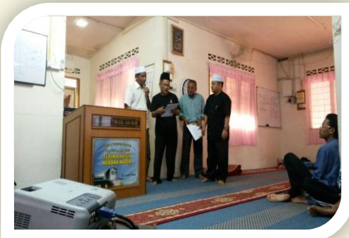
Certificate Giving Ceremony was held at Surau Ulu Yam