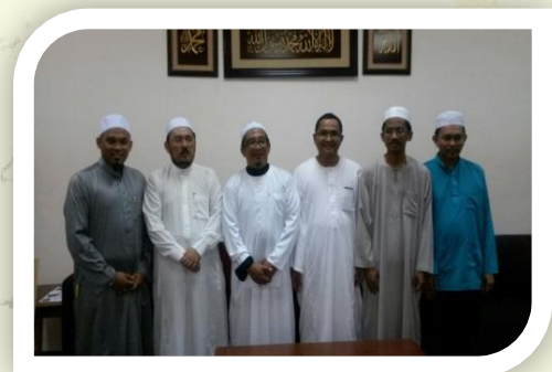
Photography session between the staff and the guests