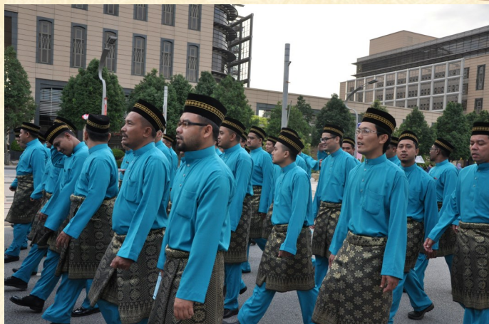
MAULIDUR RASUL CELEBRATION AT PUTRAJAYA